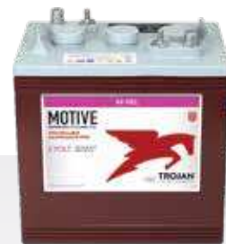
MOTIVE 6-VOLT GEL