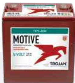
MOTIVE 8-VOLT AGM