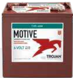
MOTIVE 6-VOLT AGM