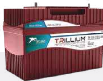
TR 12.8-110 LI-ION

Microprocessor Cell Balancing CAN Communications Amp-Hour Life Tracking SOC Gauge Battery Management System