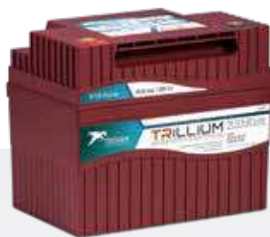
TR 12.8-92 LI-ION

Trillium gives you more runtime and longer life than other batteries in its class and delivers consistent power across the state of charge range. It's 20% smaller than competitors' batteries, can be charged in less than two hours, and is scalable up to 48 volts.