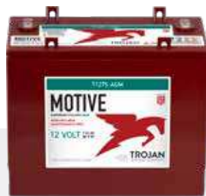
MOTIVE 12-VOLT AGM