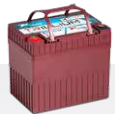
TR 25.6-25 LI-ION

Microprocessor Amp-Hour Life Tracking SOC Gauge Battery Management System Cell Balancing